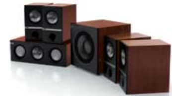
Q100 5.1 Package.