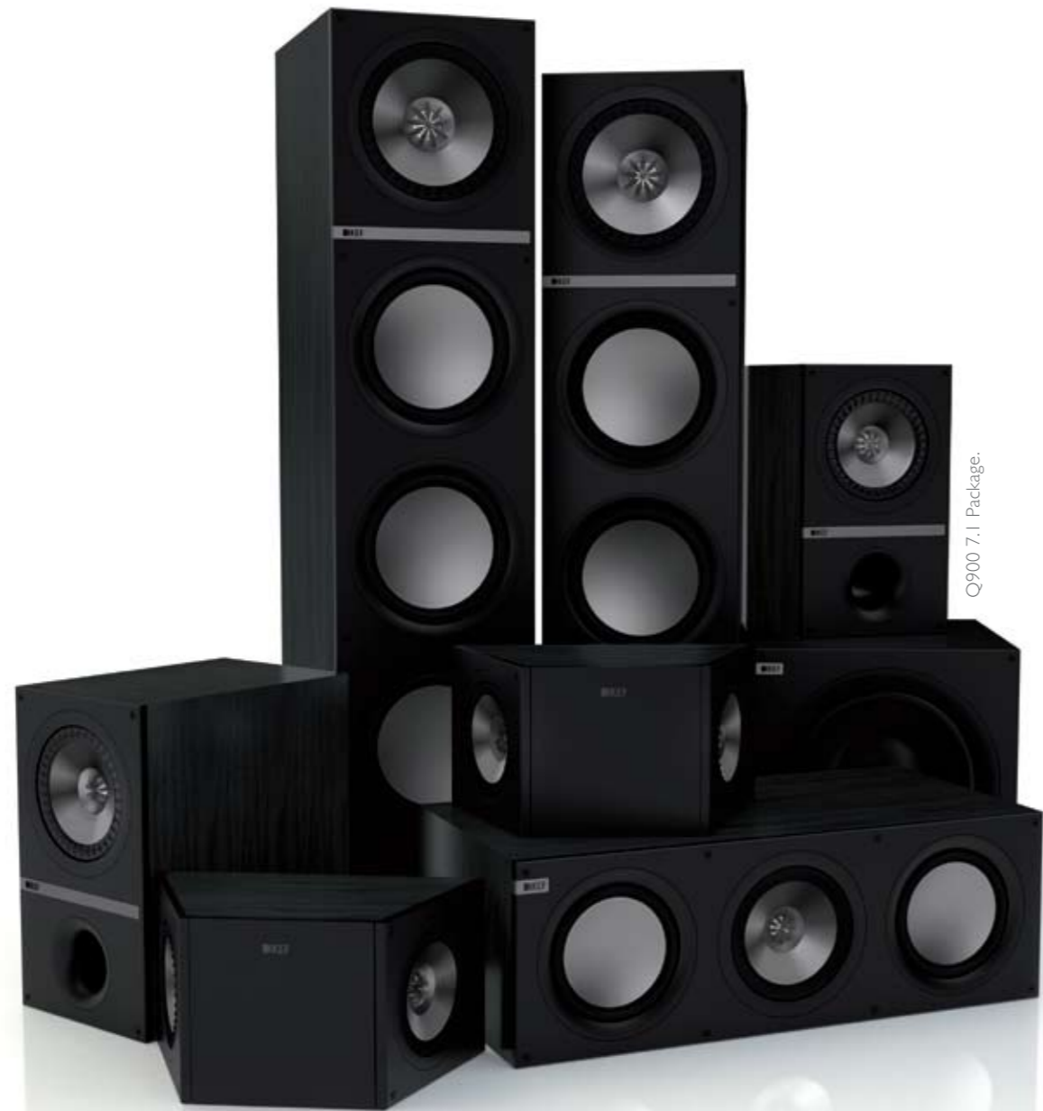
Q900 7.1 Package.