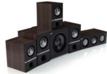
Q300 5.1 Package.