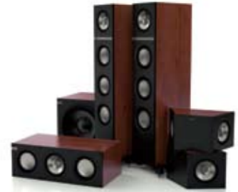
Q500 5.1 Package.