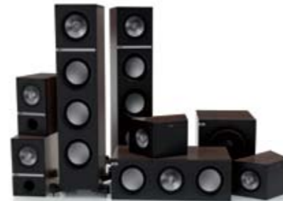
Q700 7.1 Package.